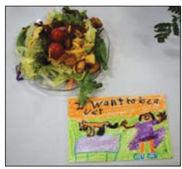
'Falling' for preschool programs, Page 10

This year's KSBA Winter Symposium will compress all the features of the two-day gatherings of the past into a single day. The other new twist? Discovering how the skills local board members learn while serving can translate into other areas of their life ... Page 21