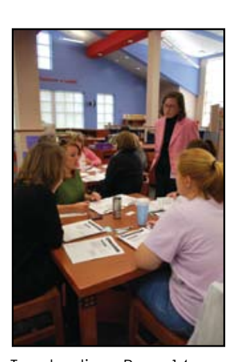
Teacher time, Page 14